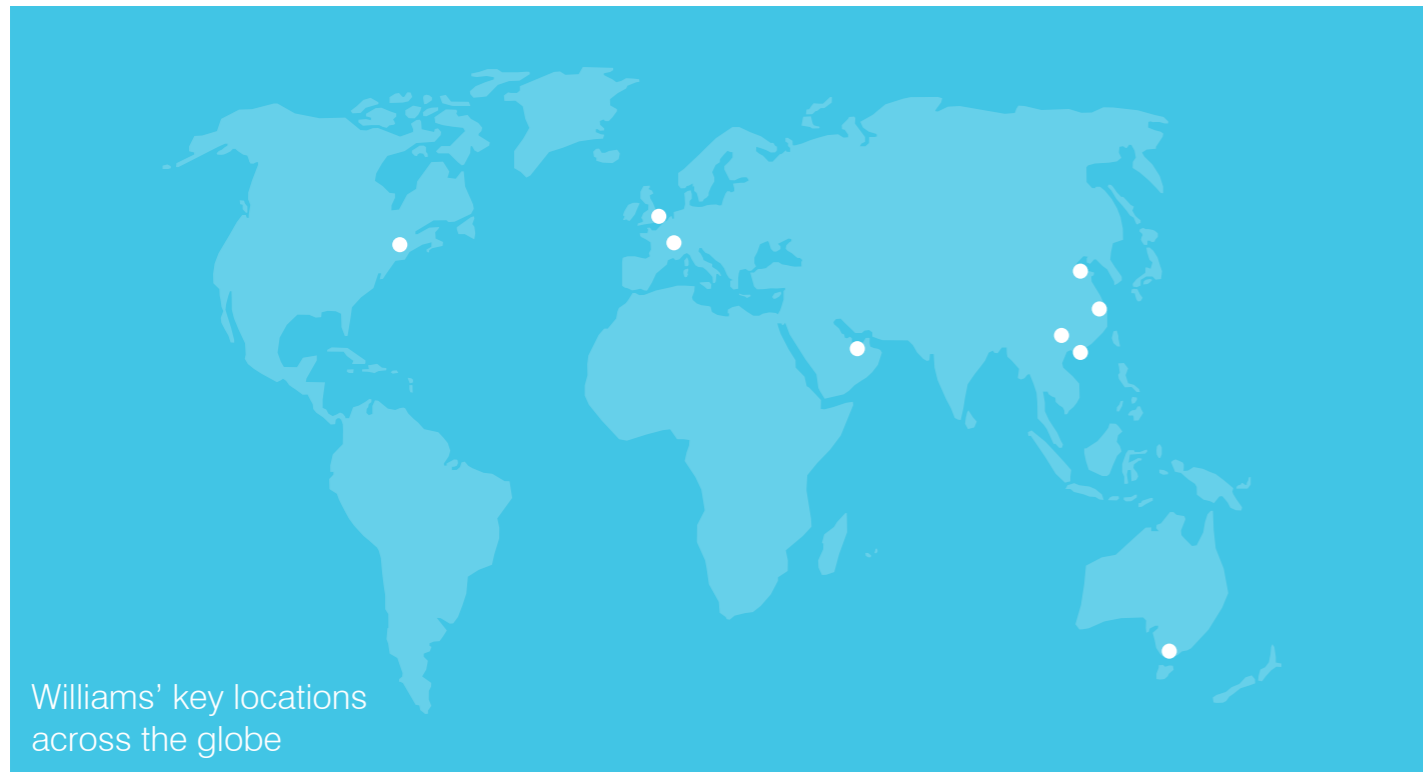
Williams' key locations across the globe