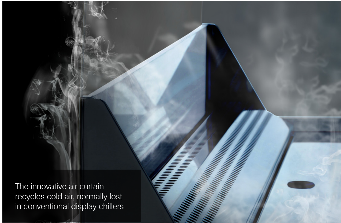
The innovative air curtain recycles cold air, normally lost in conventional display chillers